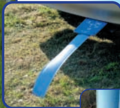
Flexible spring back action