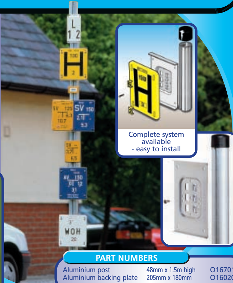
Complete system available - easy to install